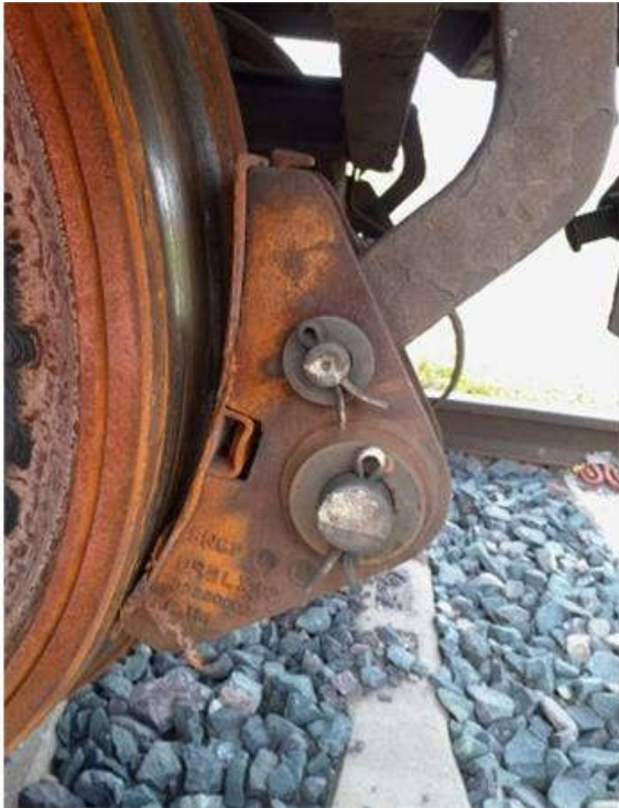
Fused brake block

→ The Risk Control Measures can be found in Part II, section 1 of this document, pages 31 - 55