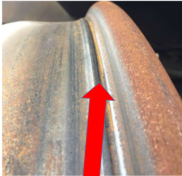
Extraordinary wheel tread deformation near the flange

The measurement tool is not part of the assessment