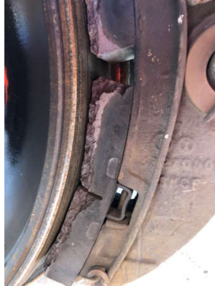
Change of color and broken out brake block material