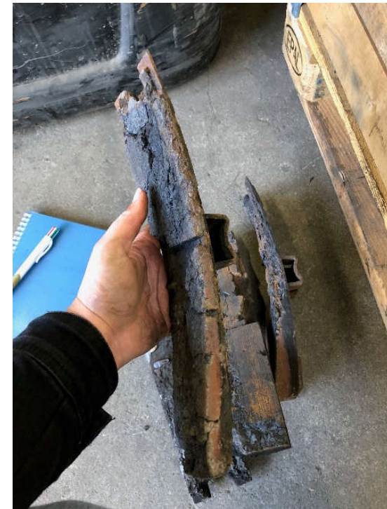
Carbonized brake block