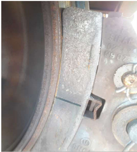
Brake block in normal conditions

→ The Risk Control Measures can be found in Part II, section 1 of this document, pages 31 - 55