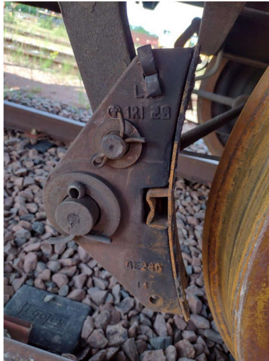
Fused brake block