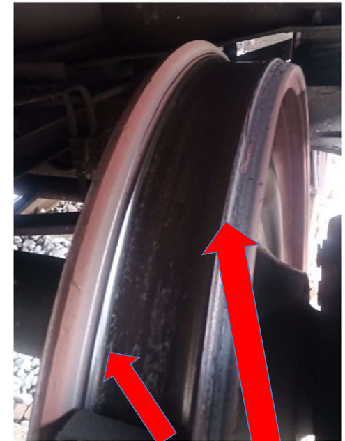
Extraordinary wheel tread deformation on the outer side of the tread and near the flange