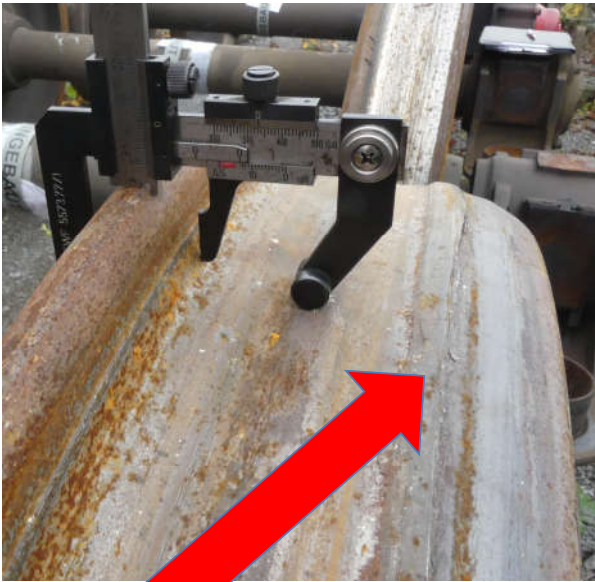
Extraordinary wheel tread deformation on the outer side of the tread

→ The Risk Control Measures can be found in Part II, section 1 of this document, pages 31 - 55